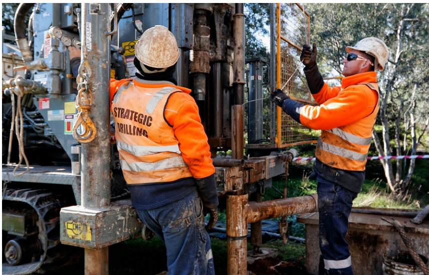
↑ Site investigations at Toolern Creek

350 site investigations have been completed and nearly 90 boreholes have been dug to understand ground conditions, and inform design and construction of the project.