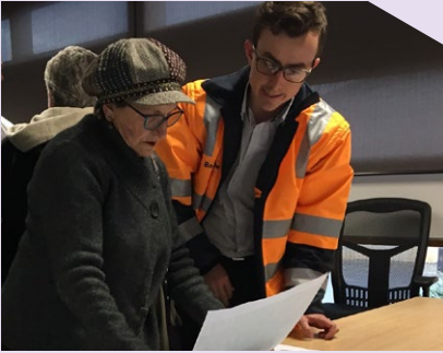
↑ Staff at station design consultation meeting