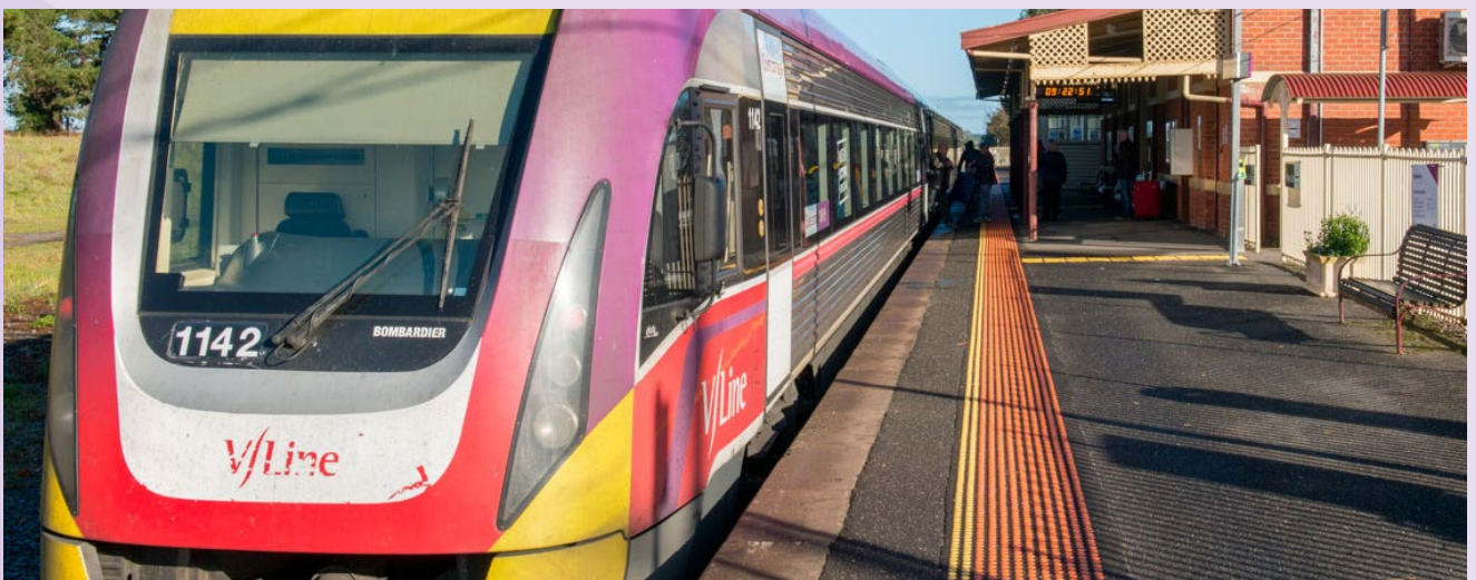
↑ Existing station platform at Ballan station

The project is being delivered by the Melbourne Metro Rail Authority (MMRA). MMRA includes some of Australia's most experienced rail experts and is also delivering the Metro Tunnel Project, Victoria's biggest public transport project ever.