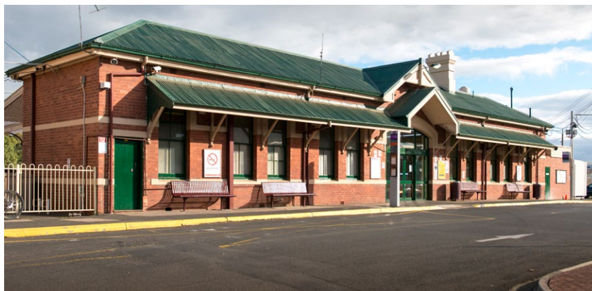
↑ Bacchus Marsh station

Three train stations along the Ballarat rail corridor, Bacchus Marsh, Ballan and Melton, are recognised to have important heritage values and our works will recognise and protect them.